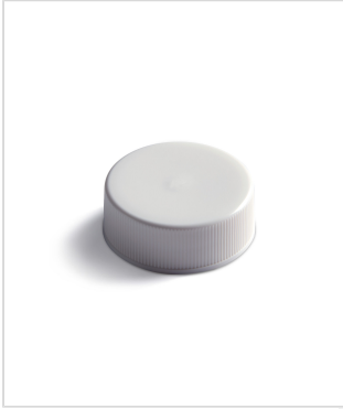
28 mm Continuous Thread Ribbed Side Smooth Top